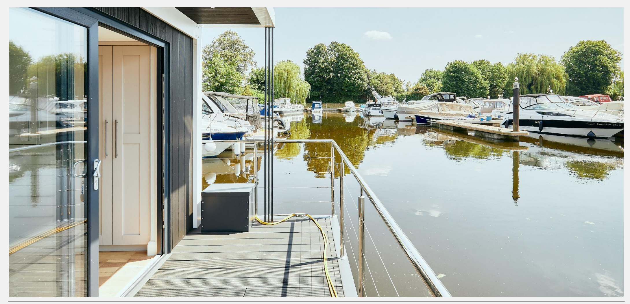
World Waterside Ltd trading as riverhomes for themselves and its clients give notice that 1: They are not authorised to make or give any representations or warranties in relation to the property either here or elsewhere, either on their own behalf or on behalf of their client or otherwise. 2: These particulars do not form part of any offer or contract and must not be relied upon as statements or representations of fact. Any areas, measurements or distances are approximate. The text, photographs and plans are for guidance only and are not necessarily comprehensive. 3: the should not be assurements or distances are approximate. The text, photographs and plans are for guidance only and are not necessarily comprehensive. 3: the property has all necessary planning, building regulation or other consents and any services, equipment of racilities have not been tested. 4: Lease details, service charges, ground rent (where applicable) and council tax are give and should be checked by visually and any intending purchasers or tenants must satisfy themselves by inspection or otherwise as to the correctness of each of the statements or particulars. If you require clarification of any points please contact us.