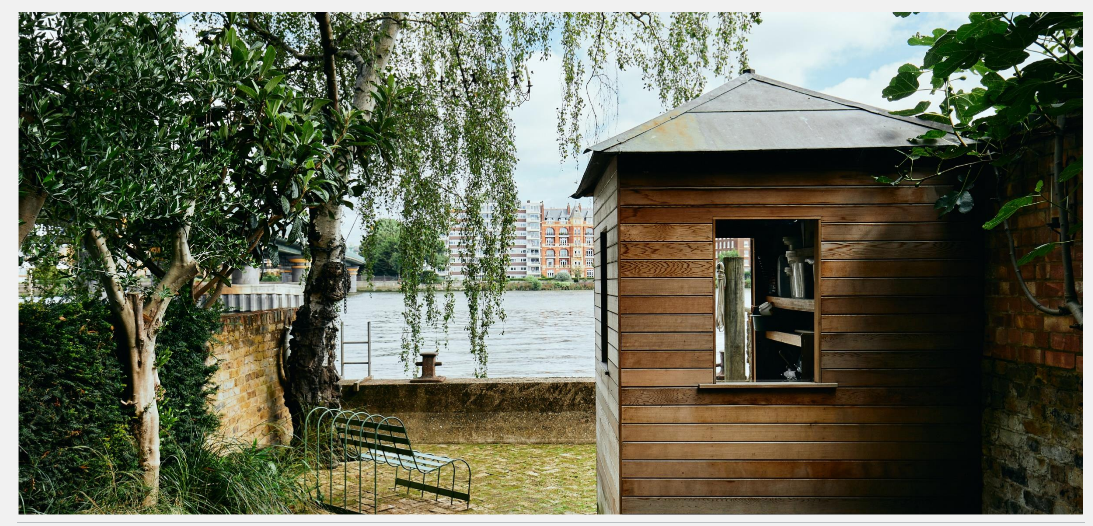
World Waterside Ltd trading as riverhomes for themselves and its clients give notice that 1: They are not authorised to make or give any representations or warranties in relation to the property either here or elsewhere, either on their own behalf or on behalf of their client or otherwise. 2: These particulars do not form part of any offer or contract and must not be relied upon as statements or representations of fact. Any areas, measurements or distances are approximate. The text, photographs and plans are for guidance only and are not necessarily comprehensive. 3: the should not be assurements or distances are approximate. The text, photographs and plans are for guidance only and are not necessarily comprehensive. 3: the property has all necessary planning, building regulation or other consents and any services, equipment of realities have not been tested. 4: Lease details, service charges, ground rent (where applicable) and council tax are given as a guide only and should be checked by visually and any intending purchasers or tenants must satisfy themselves by inspection or otherwise as to the correctness of each of the statements or particulars. If you require clarification of any points please contact us.